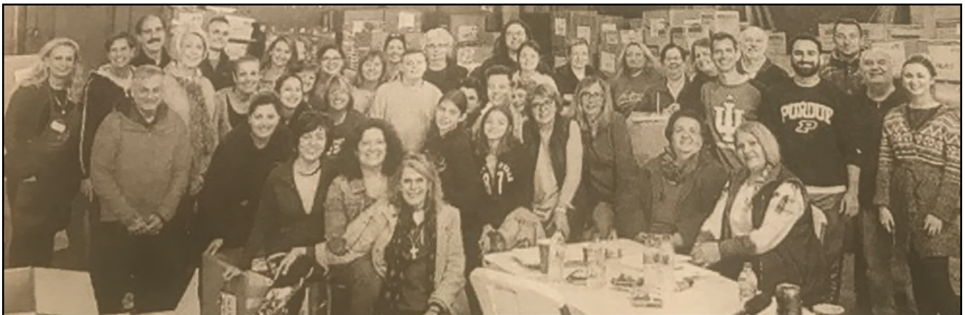
2019 Lifeline Christmas Packing, Lifeline Warehouse, Gary, Indiana Monroeville Kolo members and parishioners in attendance