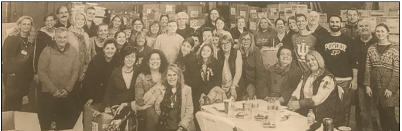
2019 Lifeline Christmas Packing, Lifeline Warehouse, Gary, Indiana Monroeville Kolo members and parishioners in attendance